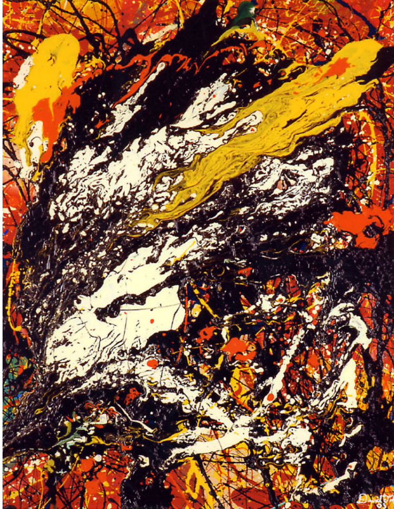
Momentum. 2003, oil, 30 x 24