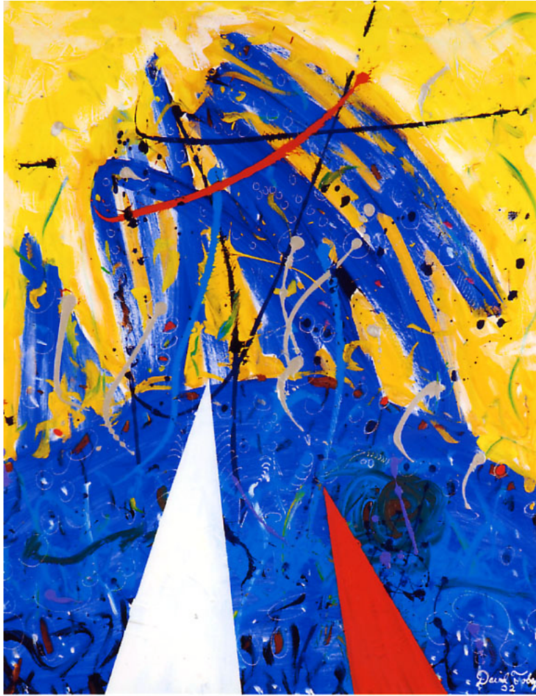
Exuberance. 2003, acrylic, 30 x 24