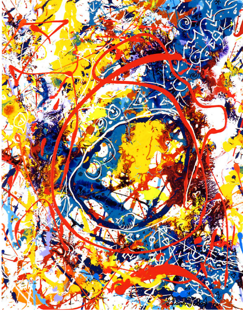
Egg II. 2005, acrylic, 20 x 16