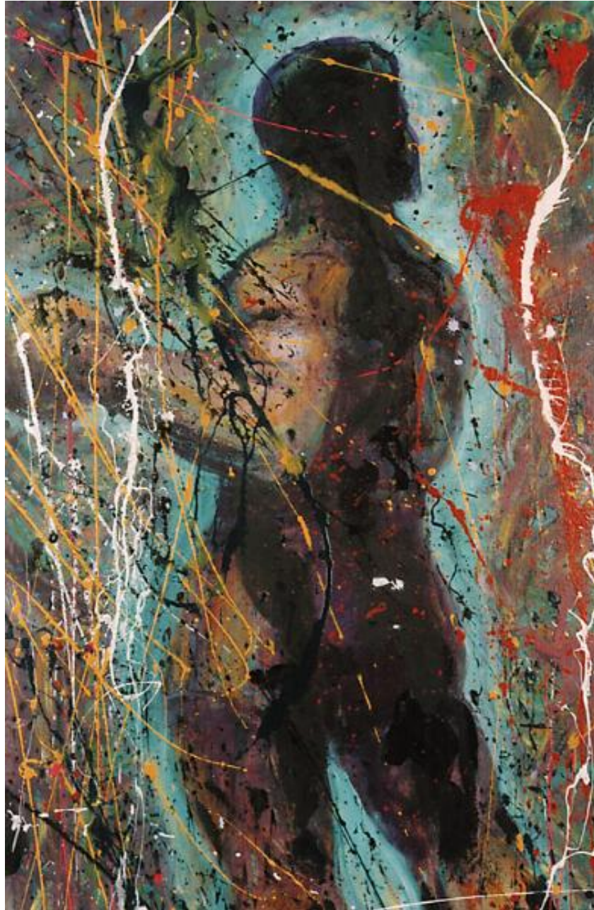
Boxer , 2003. Acrylic on Canvas, 36 x 24