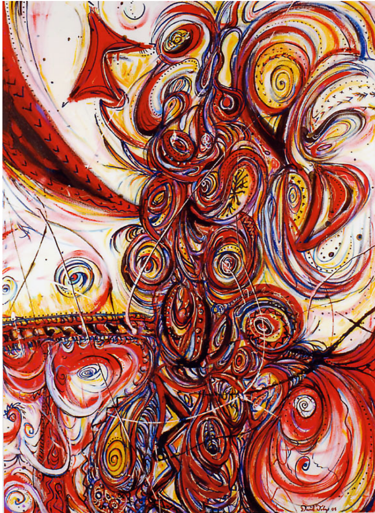
Pagliacci. 2006, acrylic, 48 x 36