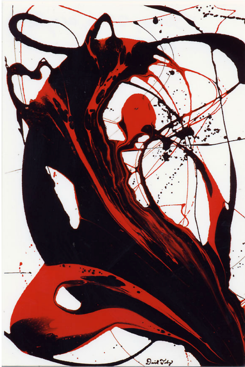
Surge. 2005, acrylic, 36 x 24