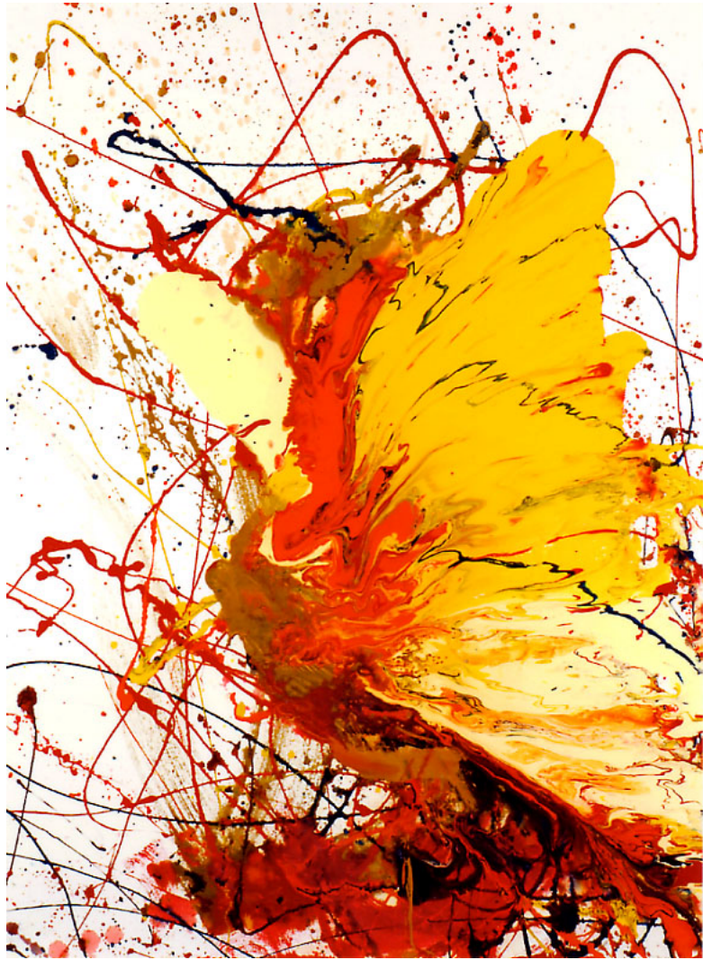
Griffin. 2005. oil, 40 x 30