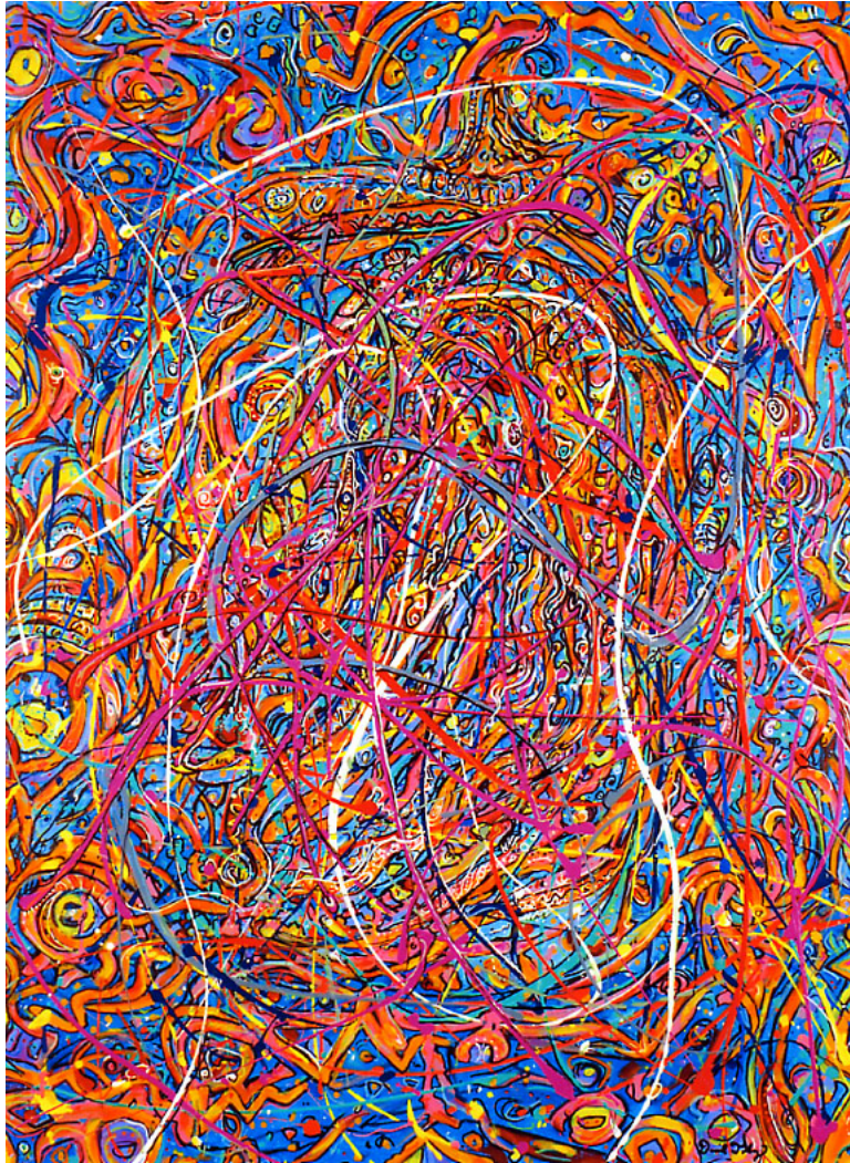
Fish Party. 2006, acrylic, 48 x 36