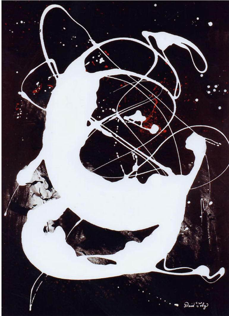
Reclining. 2005, acrylic, 20 x 30