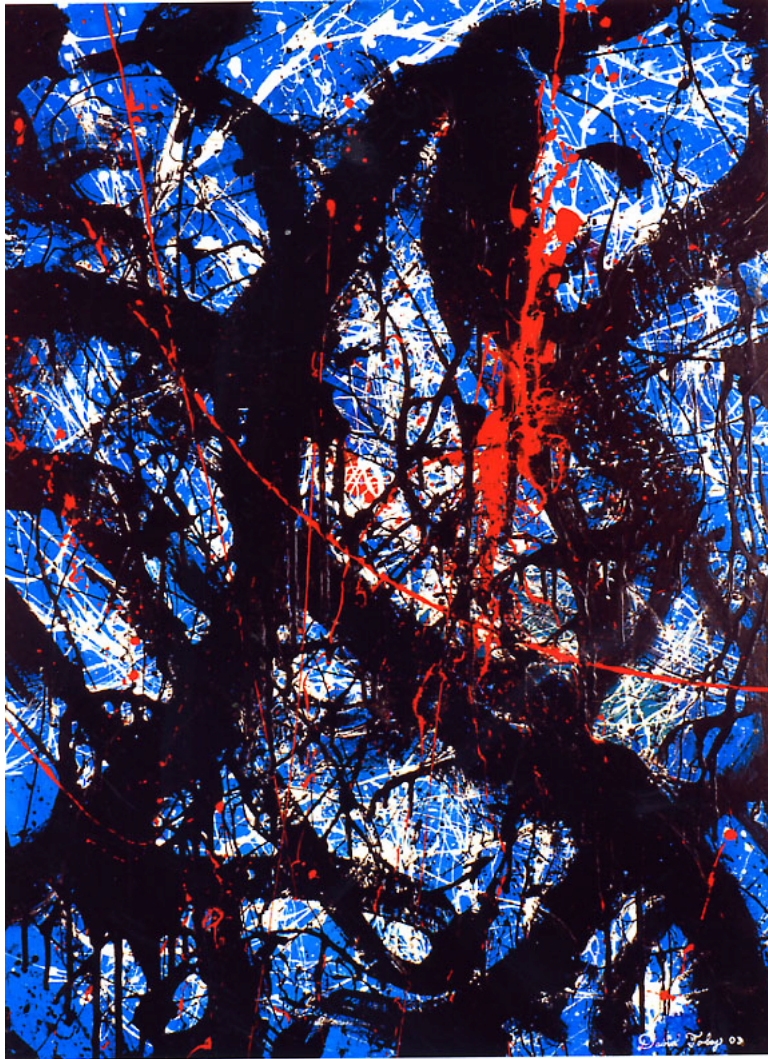
Night Terrors. 2002, acrylic, 40 x 30