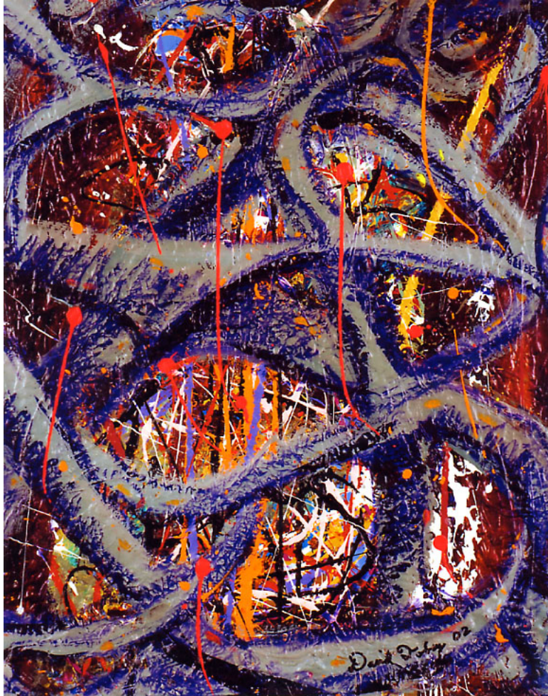
Labyrinth . 2002, acrylic, 20 x 16