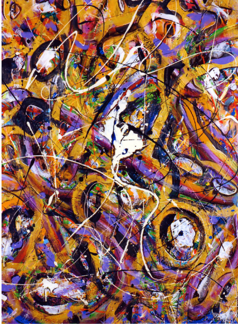
Passages. 2005, acrylic, 40 x 30