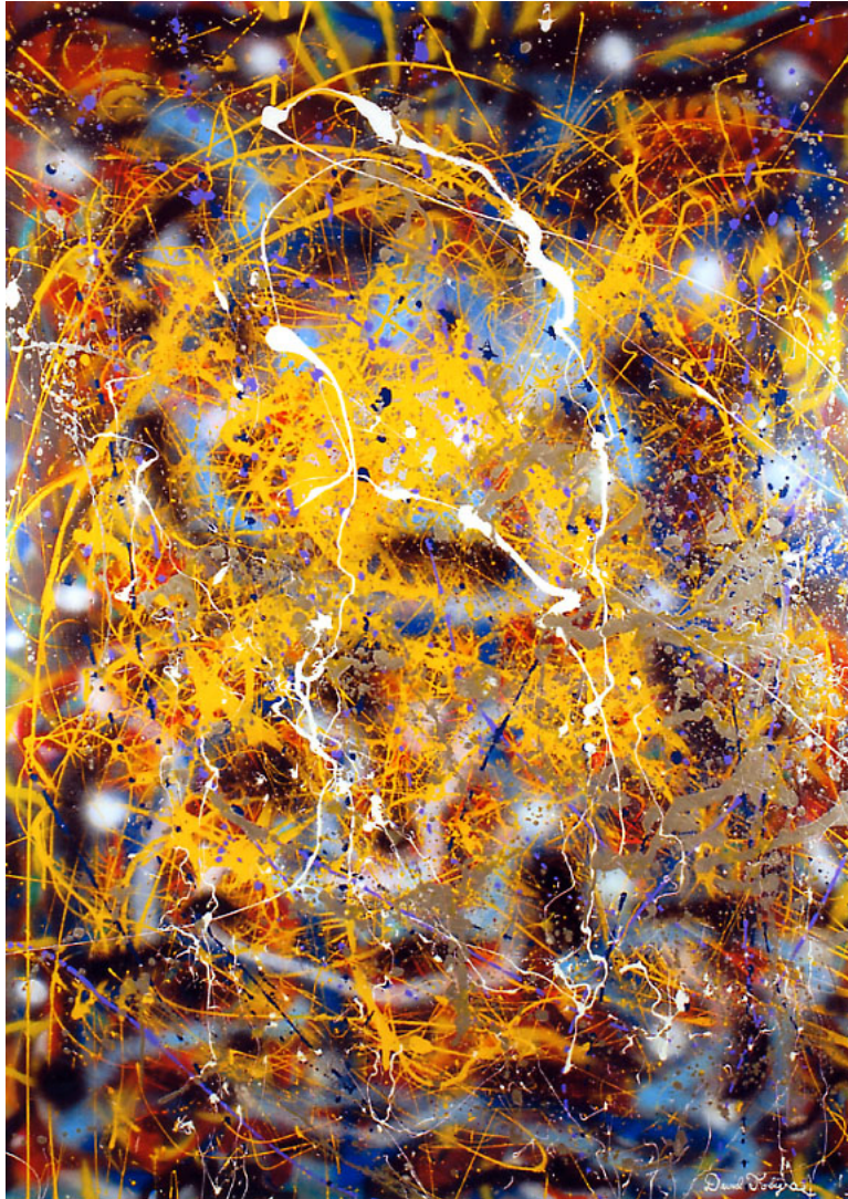
Soundings . 2003, acrylic and oil, 60 x 44