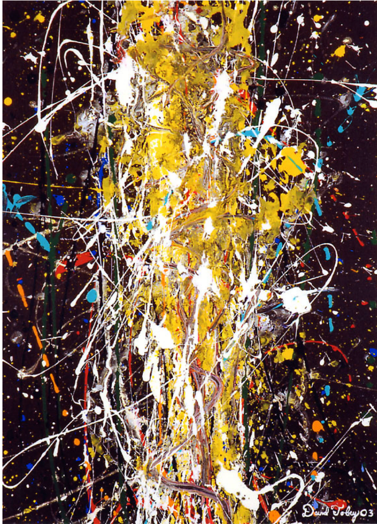
Escaping Energy. 2002, acrylic, 24 x 18