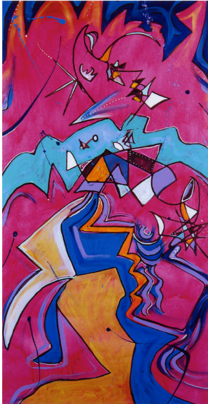
A River's View. 2007, acrylic, 30 x 40