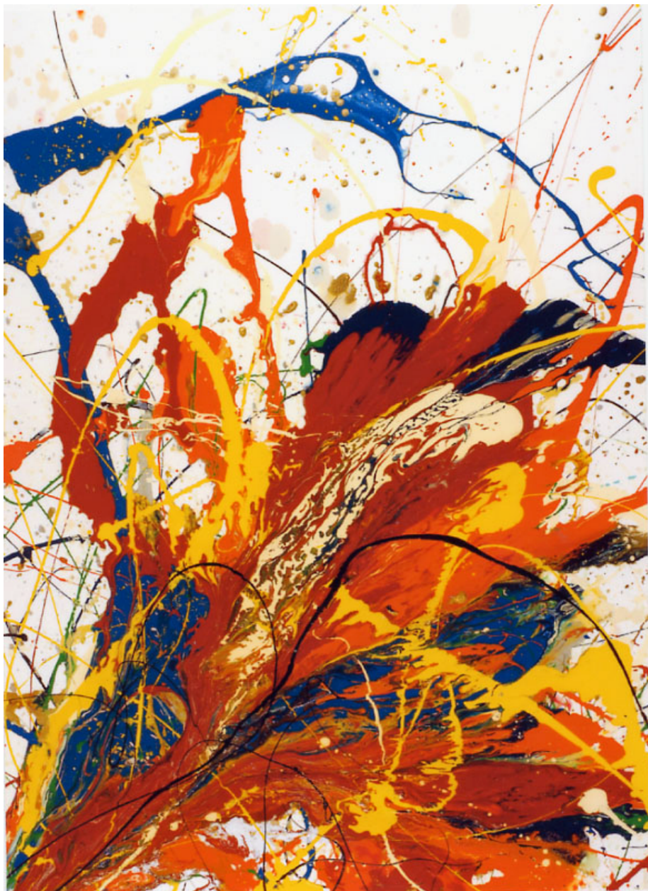
Climax . 2005, oil, 48 x 36