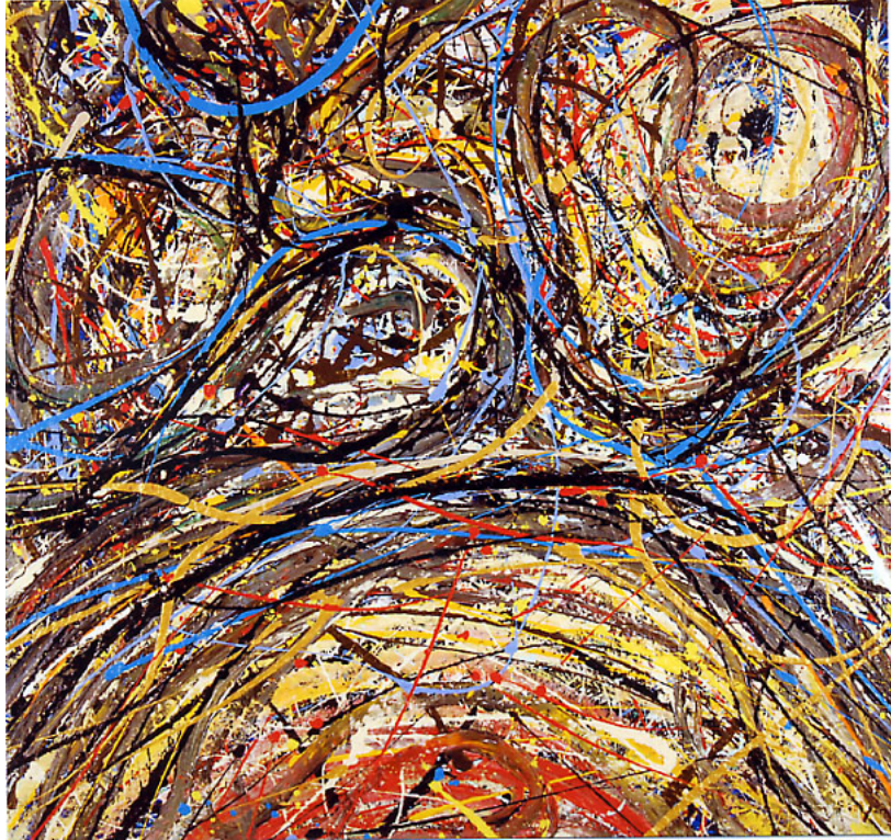
Desert of Madness. 2007, acrylic, 40 x 40