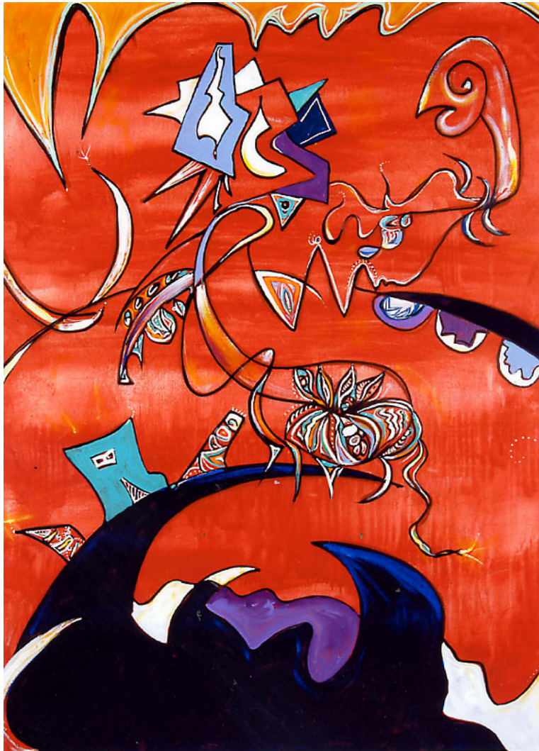
Dark Garden. 2007, acrylic, 48 x 36