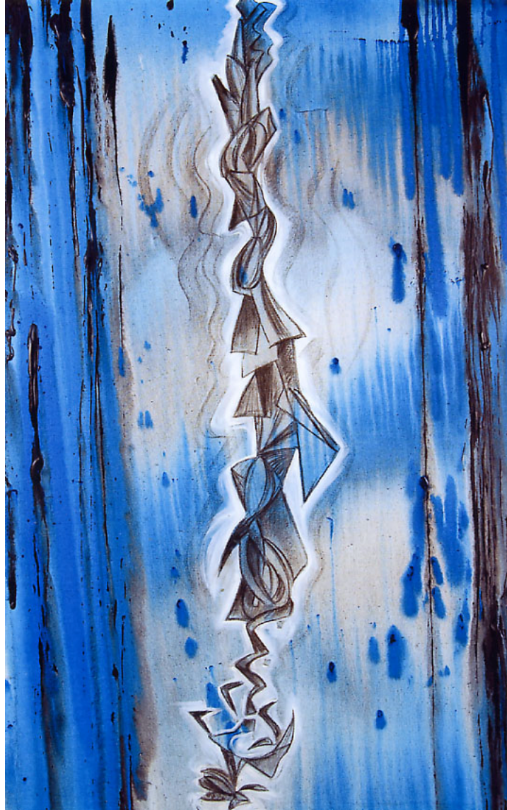
Dancing Totem. 2007, acrylic and charcoal, 60 x 36