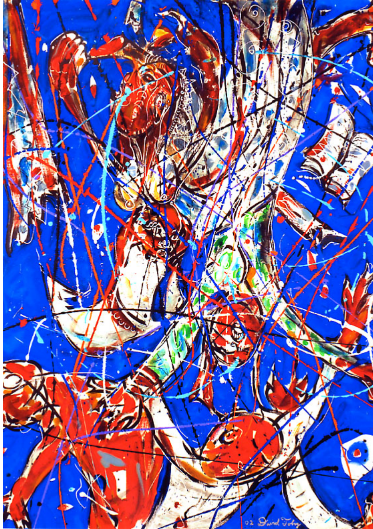
Fallen Angels 9/11. 2001-02, acrylic, 48 x 36