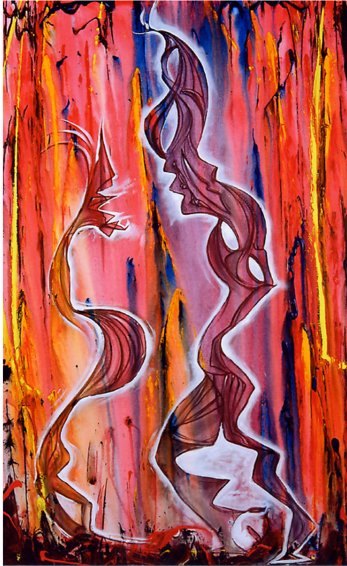
David and Goliath. 2007, acrylic and charcoal, 60 x 36