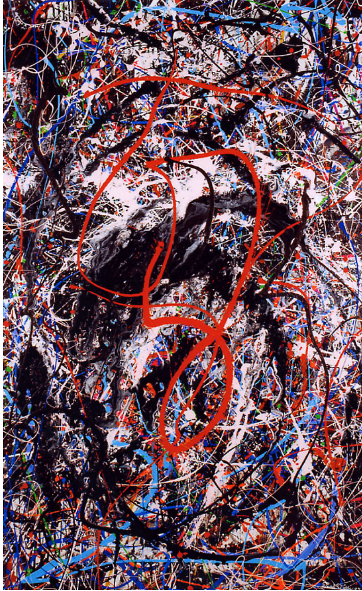
String Theory. 2006, acrylic, 60 x 36